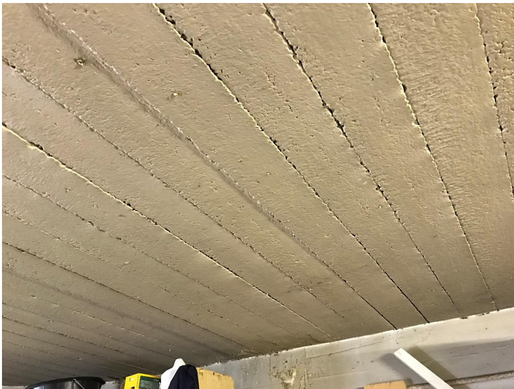
Photo 32 – Basement, underside of ground floor precast concrete beams.