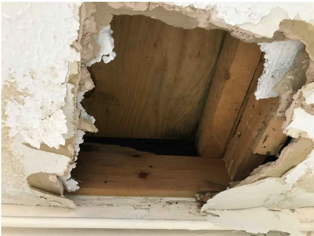
Photo 46 – Kitchen corridor, flat roof ceiling, junction with Rose Room.