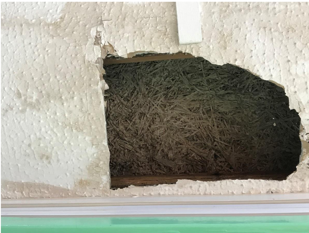
Photo 48 – Kitchen/Cloakroom corridor, south end, wood-wool slab roof decking.