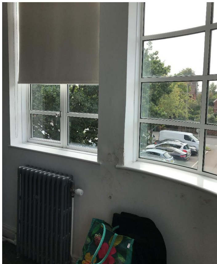
Photo 28 – First floor council office, dampness to inner curved wall.