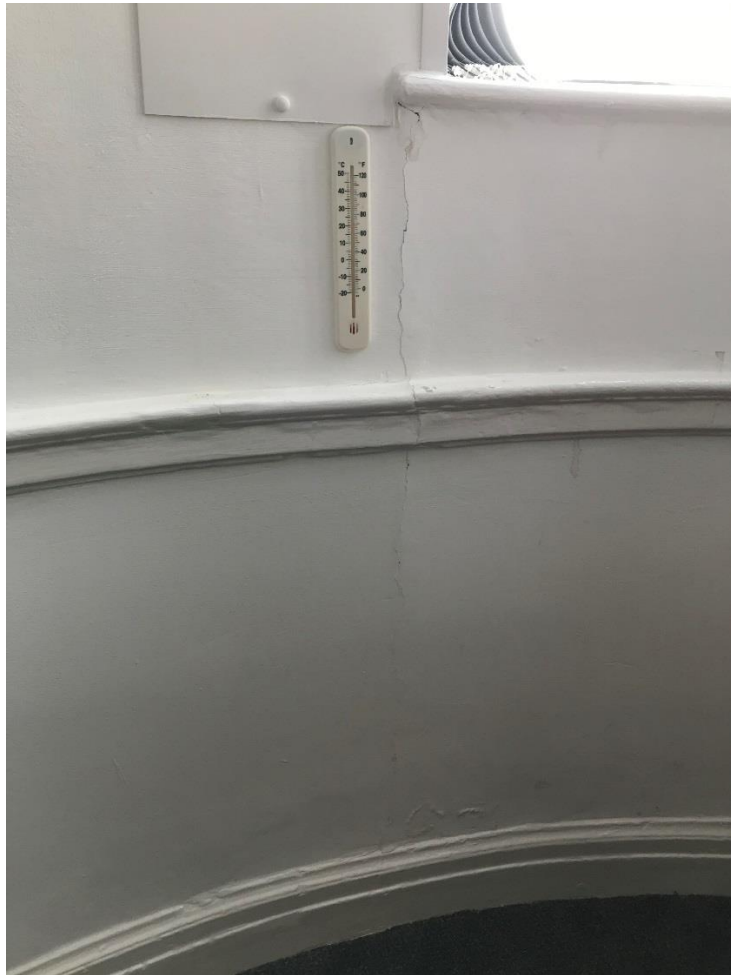
Photo 29 – First floor council office, vertical cracking to inner curved wall.