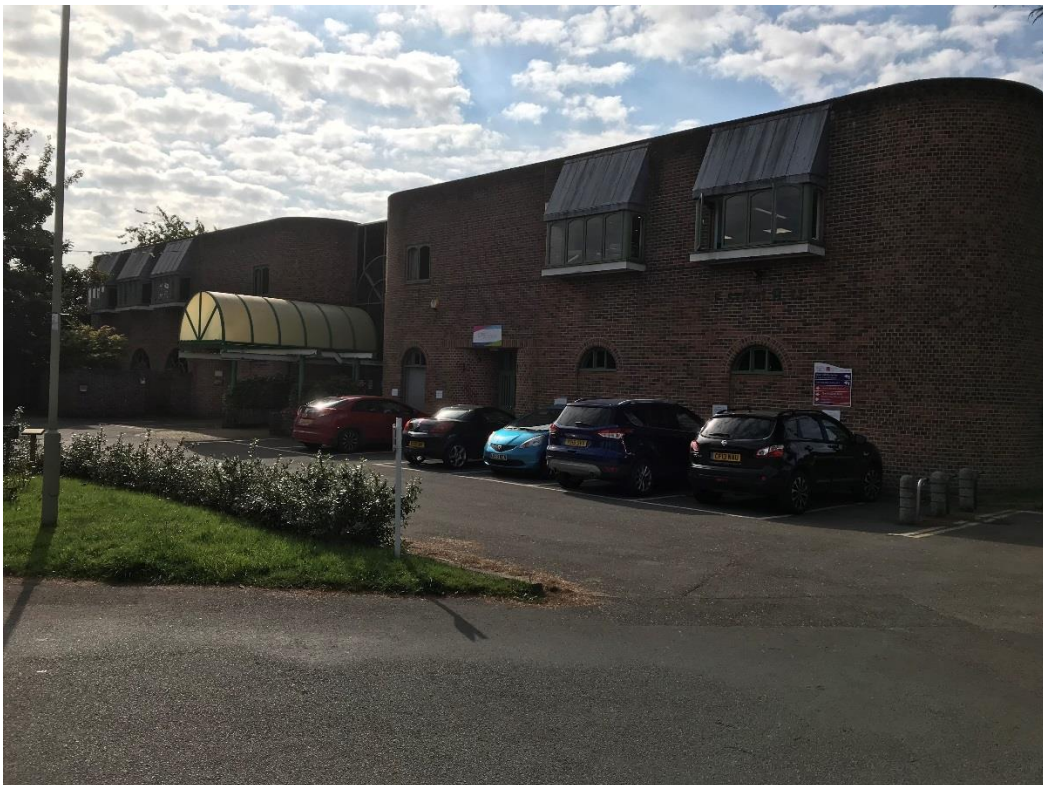
Photo 4 – Rear (north) elevation, from west end.