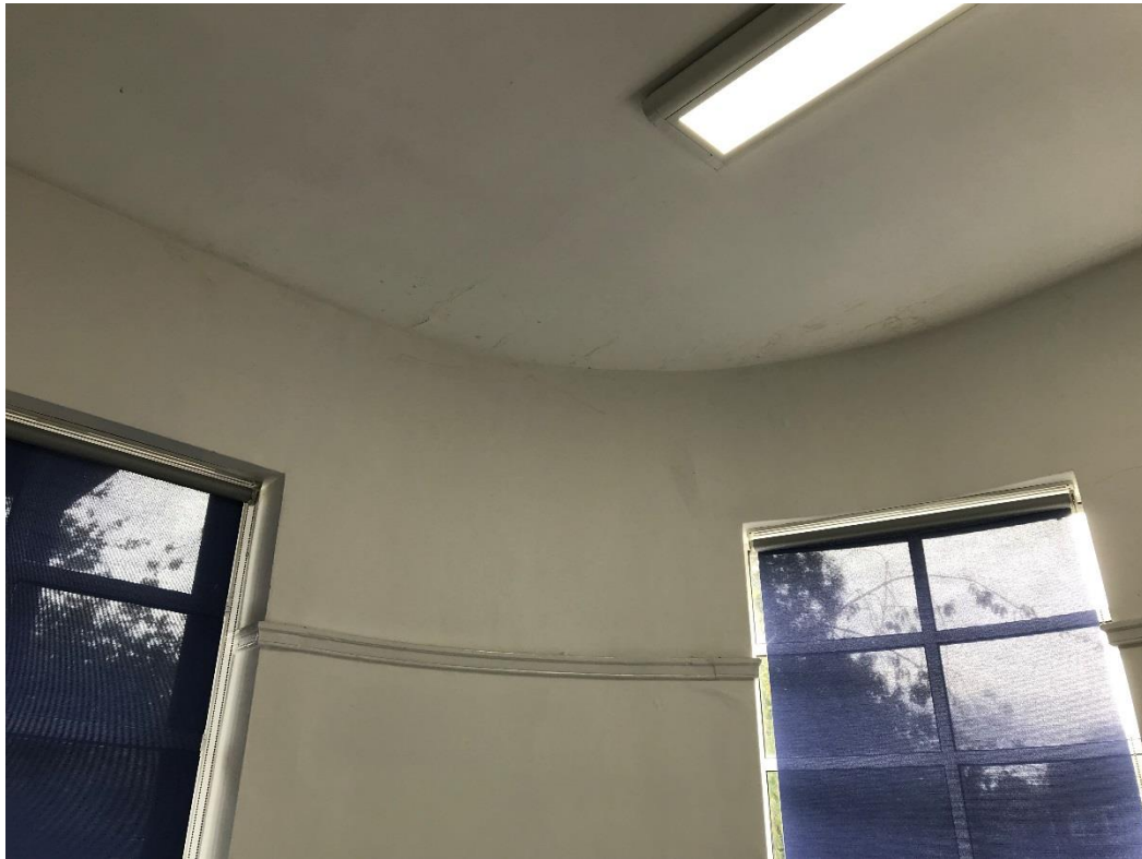
Photo 27 – Ground floor council office, dampness to coving level of inner curved wall.