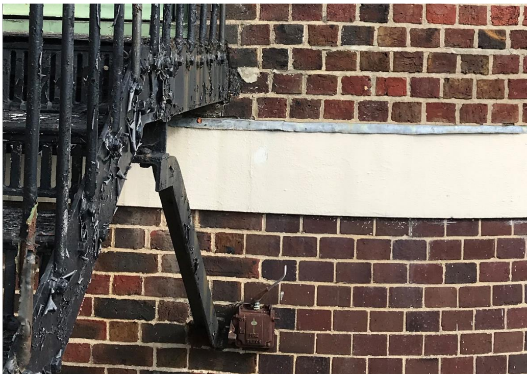
Photo 22 – Corroding/expanding metalwork, local cracking of brickwork.