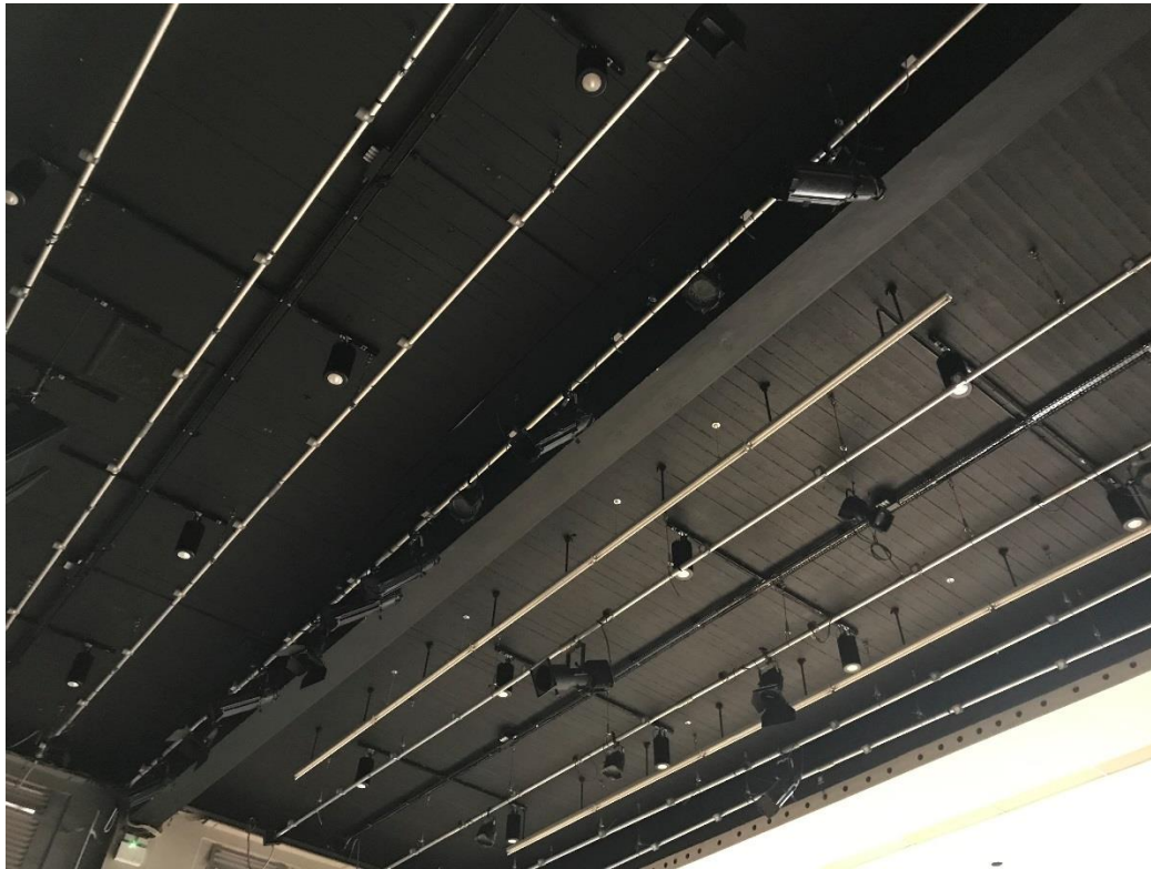
Photo 37 – Festival Hall, roof steelwork and precast concrete roof beams.