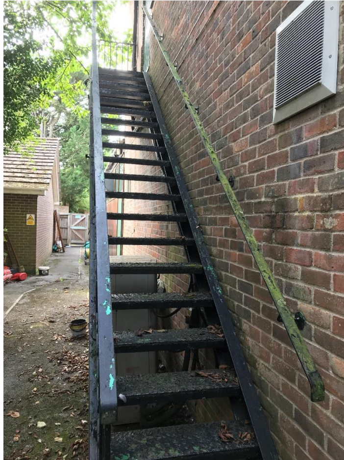
Photo 23 – North east fire escape stair from offices over Rose Room.