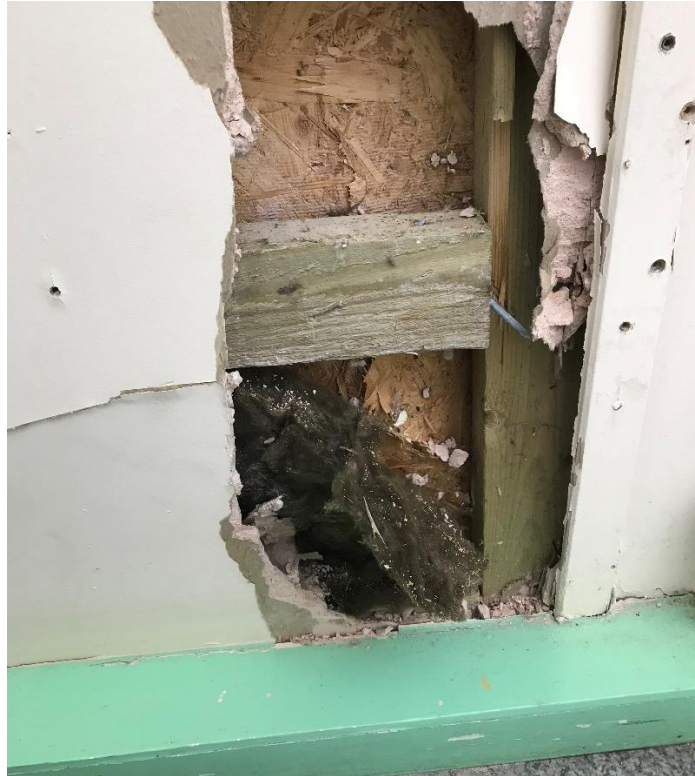
Photo 45 – Modular Building, South elevation, internal wall panel.