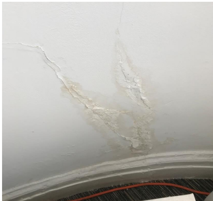
Photo 30 – First floor council office, cracking and dampness to inner curved wall.