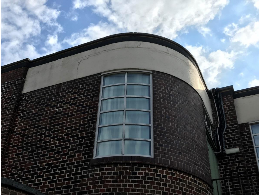
Photo 13 – South west, upper curved corner, adjacent spiral fire escape stair.