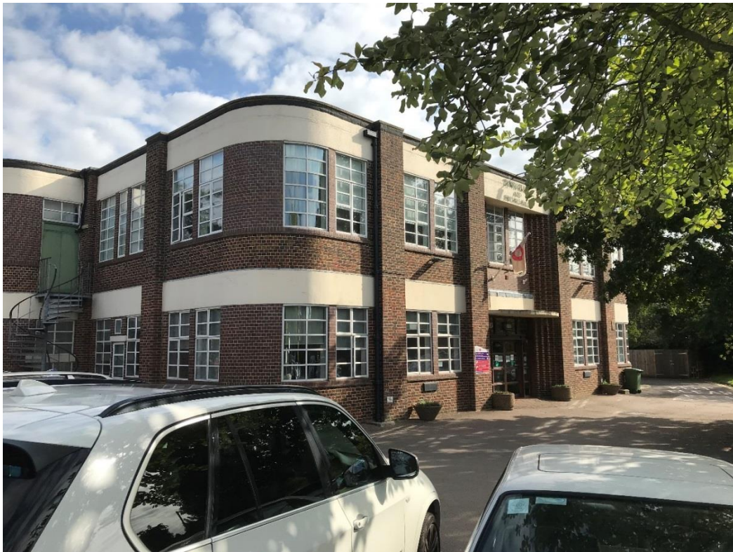
Photo 1 – Front (south) elevation, from west.