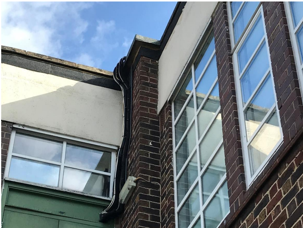
Photo 14 – South west, high level, adjacent spiral stair fire escape.