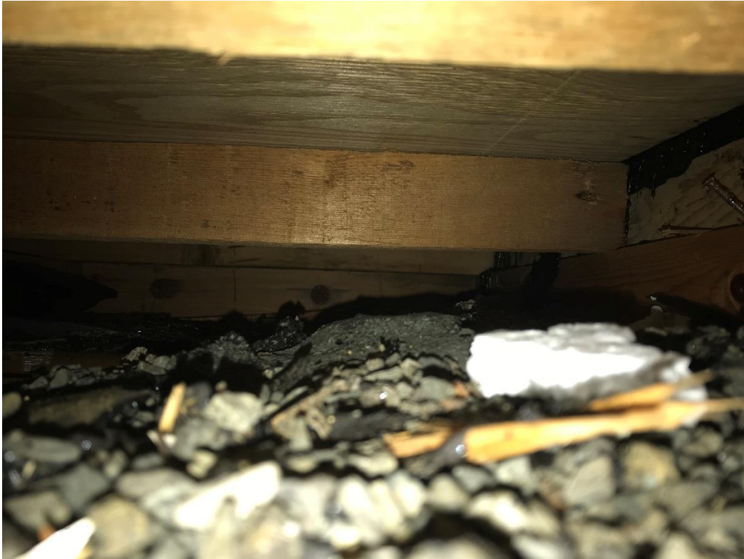
Photo 47 – Kitchen corridor, flat roof ceiling void, debris from previous roof repair, recovering.