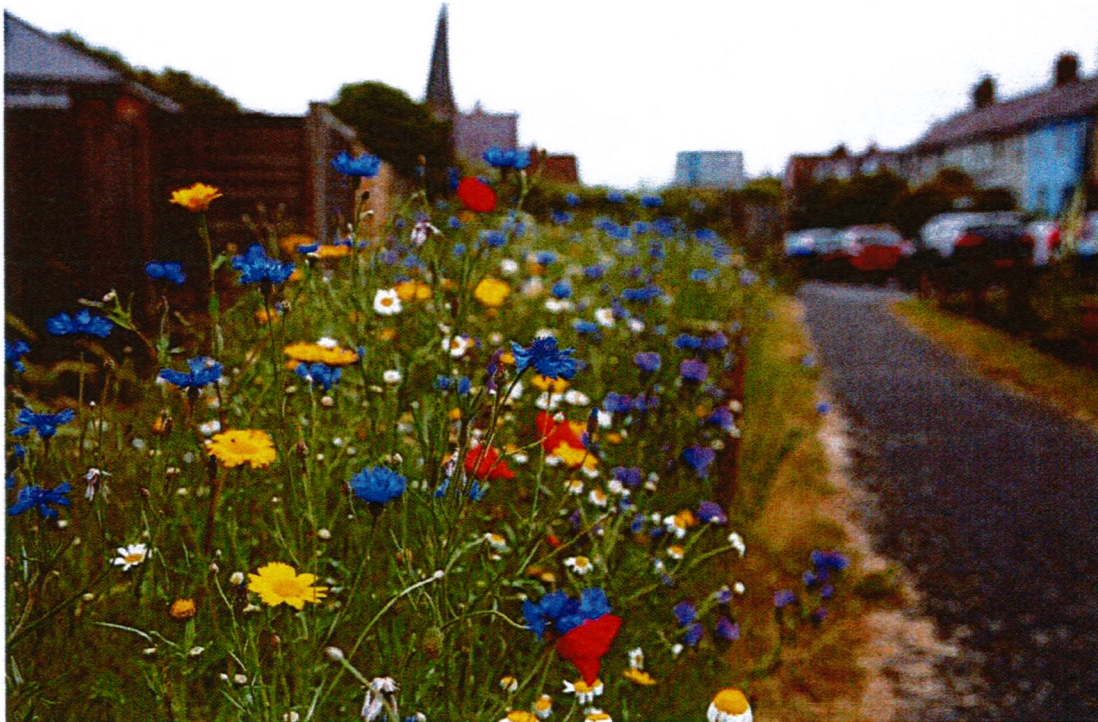
Figure 1. Wildflower meadow area created in Alton, 2021.

In June, July and August 2022, many parts of Britain suffered from a prolonged period of dry weather 8 , including several 'heatwaves'. 2022 was the hottest year on record in the UK. At a national level, risk of wildfire to certain types of vegetation was increased, and fires broke out at several locations in the country, for example locally at Bisley Ranges in Surrey 9 and Yateley Common in Hampshire 10 . Fortunately, no wildfires were recorded in Petersfield parish in 2022, but a decision was made to intervene and cut back grass verges at some locations, such as Ramshill Estate where they had been left unmown during May in accordance with the national 'No Mow May' campaign 11 . Subsequently, the Head of Grounds Committee asserted at Grounds Committee meetings and at the Town Meeting on 8 th March 2023 that she has concerns about the establishment of new wildflower areas because of the risk of ignition and wildfire spread. As a result, proposals to establish small areas of wildflower meadow at two greenspace sites put forward in November 2022 by the Petersfield Society for consideration by Grounds Committee have been rejected.